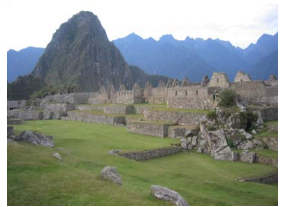
Courtyard at Machu Picchu

"It gave me the unique opportunity to see myself being able to move comfortably within the two worlds. A real sense of what bilingual and bicultural means"