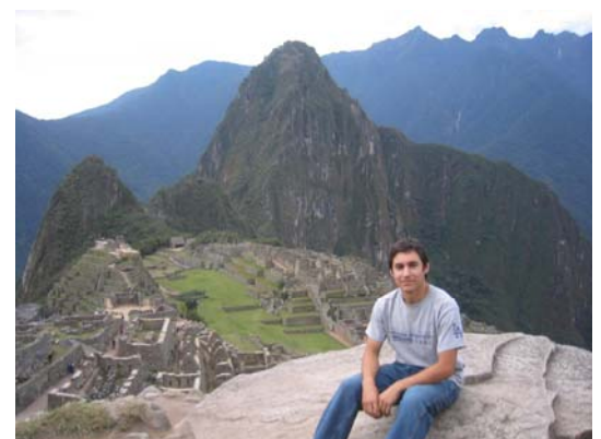
Looking over Machu Picchu