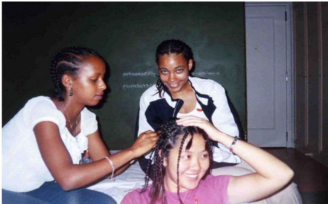
... hair braid