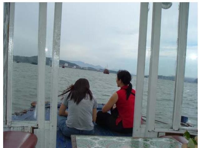
Riding a boat—Ha Long Bay