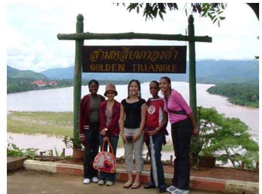
Golden triangle- a river where the countries Thailand, Myanmar and Laos meet

“ My trip to Thailand was all that I expected and more. I learned a lot, but it was still such a relaxing and fun environment”