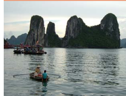
A beautiful scene in Vietnam Ha long Bay

In the end it was very hard to leave. We had made some great friends, and we had learned so much. Without MIRT, I wouldn't have had such a wonderful opportunity. “